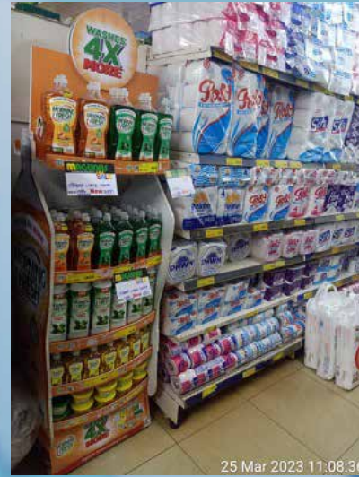
25 Mar 2023 11:08:36