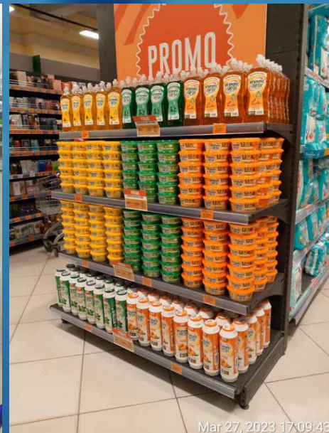
Mar 27, 2023 17:09:43