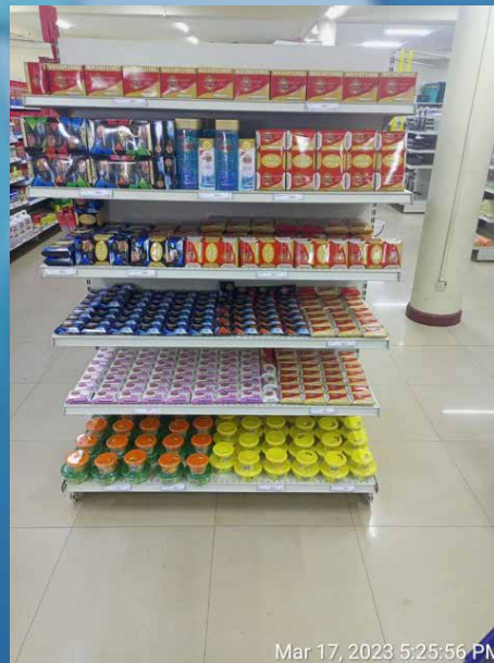
Mar 17, 2023 5:25:56 PM