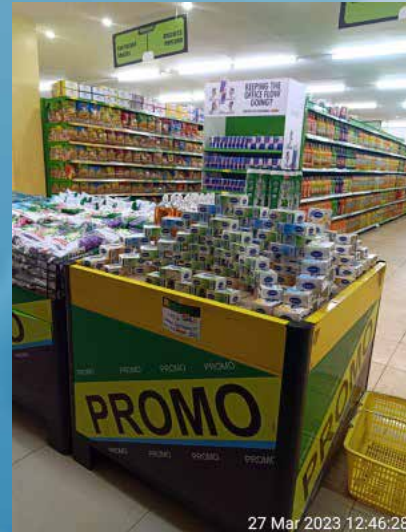
27 Mar 2023 12:46:28