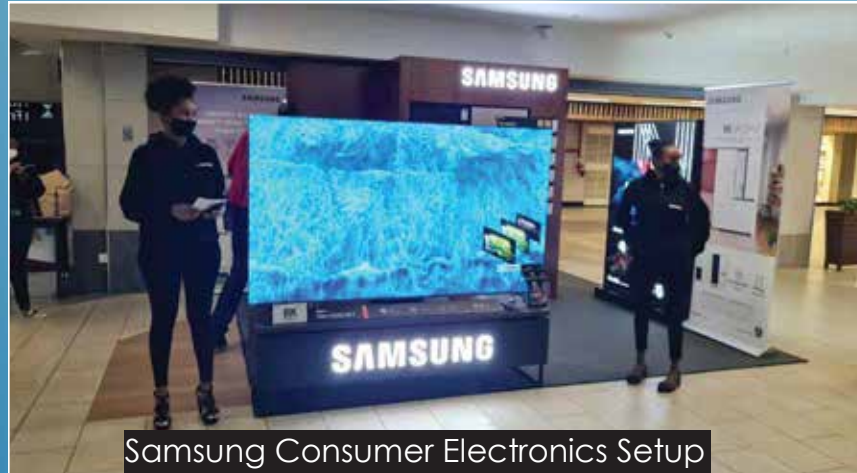
Samsung Consumer Electronics Setup