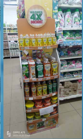
OPPO A75 2023.03.22 15:48