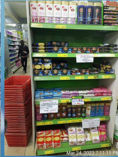
Mar 24, 2023 7:11:15 PM