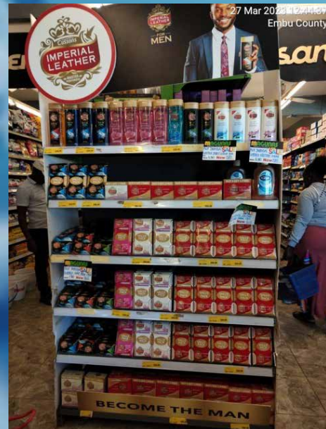
27 Mar 2023 12:46:28 Erbu County